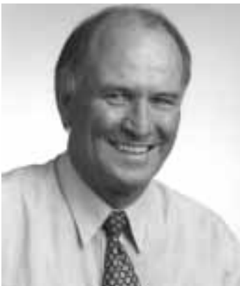
TONY WINDSOR B.Ec. MP FEDERAL MEMBER FOR NEW ENGLAND

SHOP 5, 259 PEEL STREET TAMWORTH NSW 2340 TEL: 02 6761 3080 FAX: 02 6761 3380 TOLL FREE: 1300 301 839 email: Tony.Windsor.MP@aph.gov.au