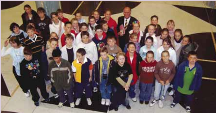
Pupils from William Cowper School (Tamworth) during a recent visit to the National Parliament.