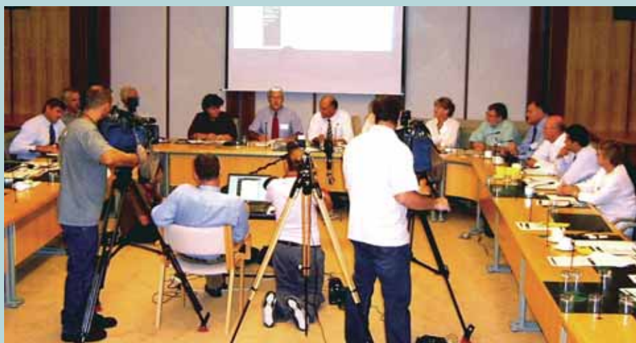
The initial ICAN Canberra meeting of Independent Federal and State Parliamentarian's Press Conference.